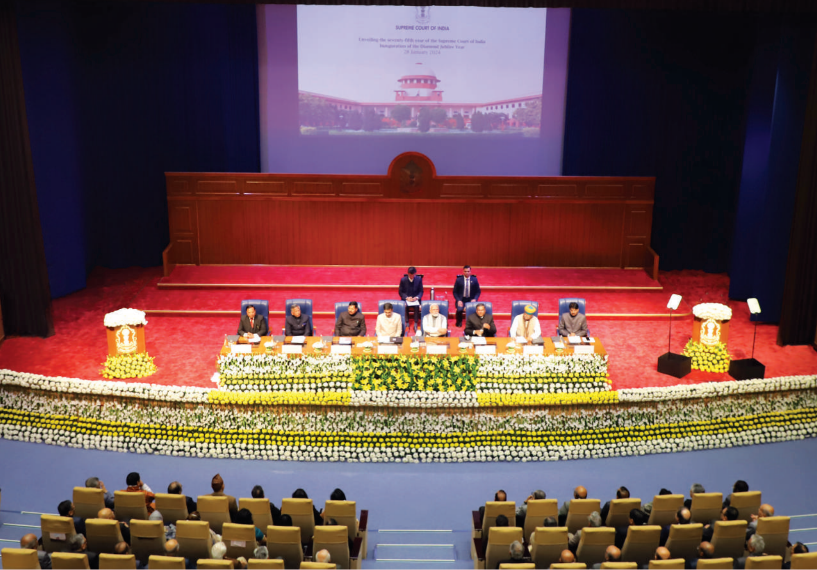
The Chief Justice of India, Dr D Y Chandrachud with the Hon'ble Prime Minister of India, Shri Narendra Modi in the presence of the Judges of the Supreme Court, Minister of State for Law and Justice (I/C), President of the Supreme Court Bar Association and Chairman of the Bar Council of India, at the commemoration of Diamond Jubilee Year

ensuring that the length of oral arguments does not interminably delay judicial outcomes and lead to the capture of judicial institutions by the powerful and the mighty; third, the provision of a level playing field for first generation lawyers and men and women from marginalised segments of society who have the will to work hard and the potential to succeed; and fourth, to beginning the conversation on long vacations and to decide, in consultation with the Bar, whether alternatives such as flexi-time for lawyers and judges is possible.