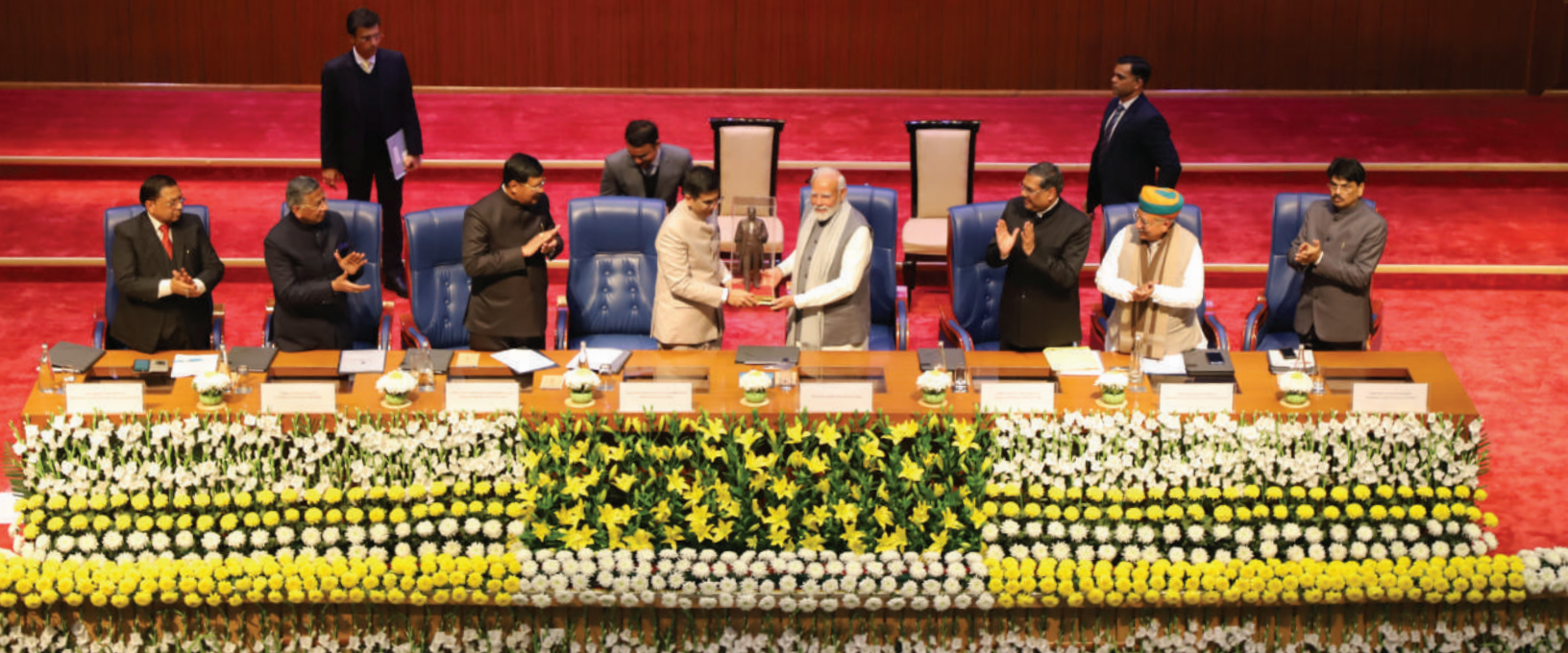
The Chief Justice of India, Dr D Y Chandrachud presenting a memento to the Prime Minister of India, Shri Narendra Modi in the presence of the Judges of the Supreme Court, Minister of State for Law and Justice (I/C), President of the Supreme Court Bar Association and Chairman of the Bar Council of India, at the commemoration of Diamond Jubilee Year