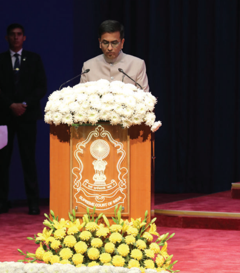
The Chief Justice of India, Dr D Y Chandrachud addressing the audience on the occasion of the Diamond Jubilee Celebrations of the Supreme Court of India

During the celebrations, the Chief Justice of India, Dr D Y Chandrachud delivered a profound address expressing gratitude to the dignitaries and recognising the historical significance of the occasion: