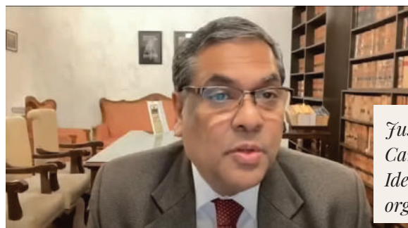
Justice Sanjiv Khanna during the virtual launch of Pan-India Campaign – "Restoring the Youth: Pan-India Campaign for Identifying Juveniles in Prisons and Rendering Legal Assistance" organised by NALSA on 25 January 2024

Justice Sanjiv Khanna while launching the campaign, emphasised, "Criminals are made by circumstances. No one is born a criminal. The path towards criminality is often a result and consequence of experiences and circumstances mostly shaped by neglect, external influences or lack of guidance." 'Restoring the Youth' is a call to action, aligning with the principles of juvenile justice, marking a significant step towards ensuring implementation of the juvenile justice laws in letter and spirit.