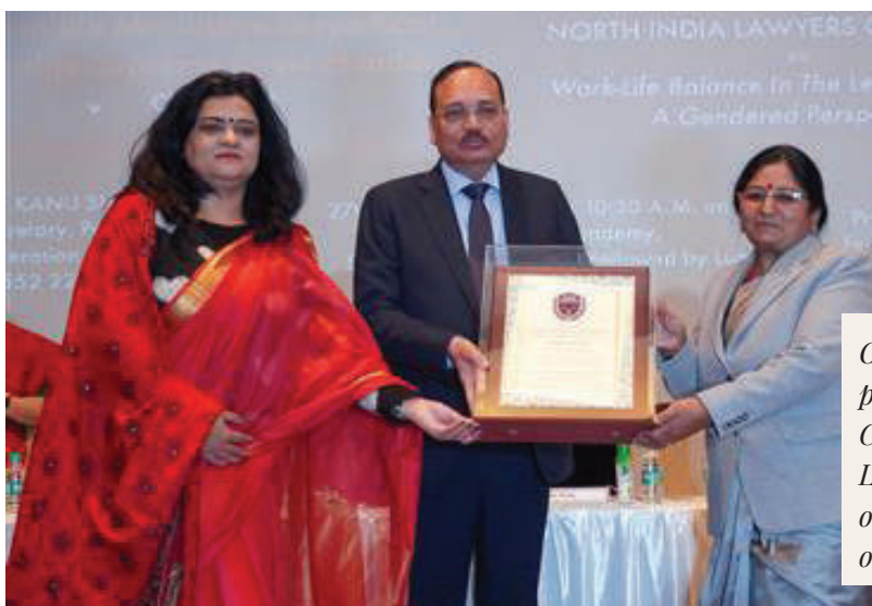
On 27 January 2024, Justice Surya Kant presided as the Chief Guest at the North-India Conference on “Work Life Balance in the Legal Profession – A Gendered Perspective” organised by Punjab and Haryana Federation of Women Lawyers, Chandigarh