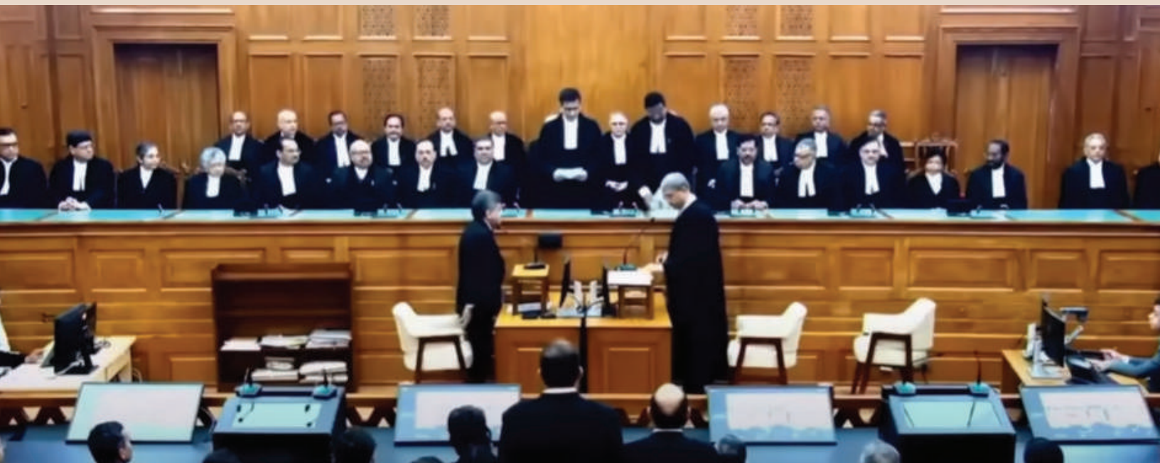
Justice Prasanna B Varale, taking oath as Judge of the Supreme Court on 25 January 2024

Justice Prasanna B Varale was appointed as an Additional Judge of the Bombay High Court on 18 July 2008, and made permanent on 15 July 2011. He was elevated as the Chief Justice of Karnataka High Court on 15 October 2022. On 25 January, Justice Prasanna was elevated as the 34th Judge of the Supreme Court.