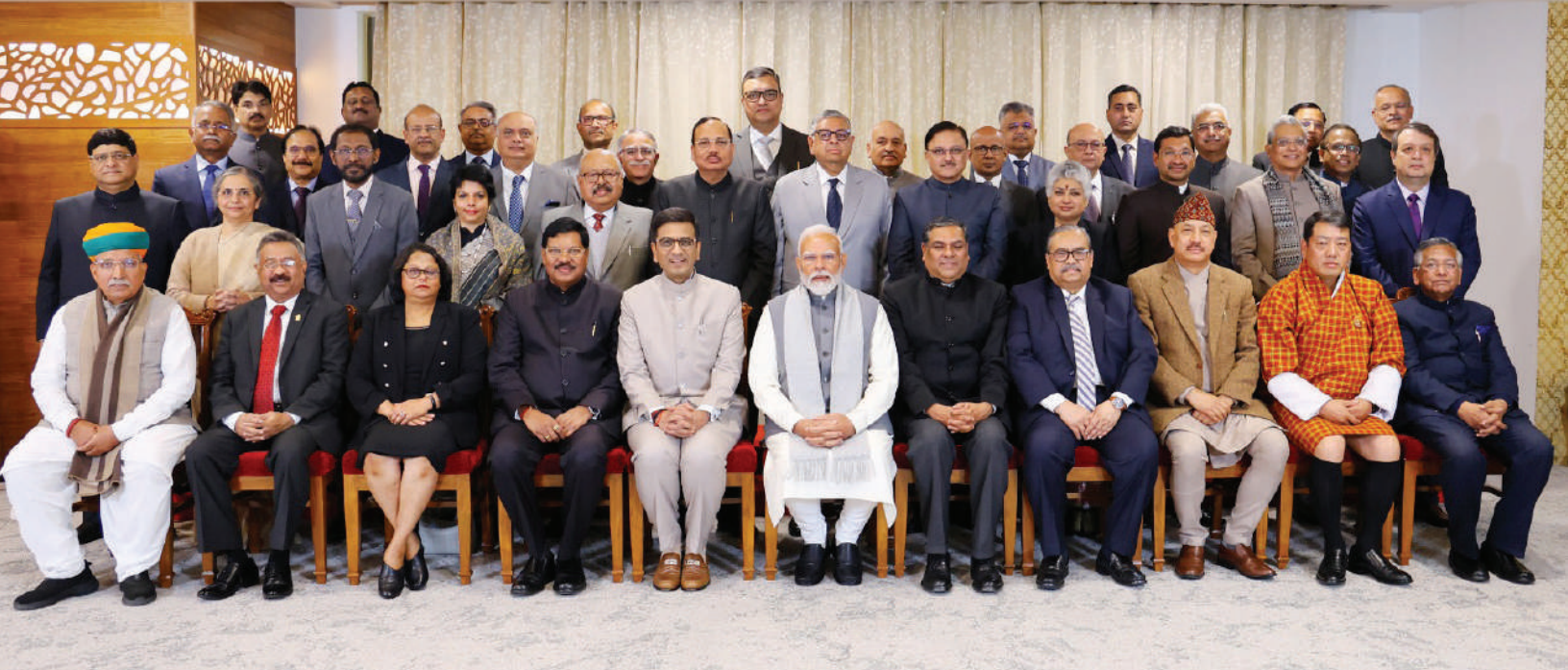
The Prime Minister of India, the Chief Justice of India, Judges of the Supreme Court, the Minister of State for Law and Justice (I/C), Attorney General of India, Solicitor General of India, President, Supreme Court Bar Association, Chairman, Bar Council of India at the commemoration of Diamond Jubilee Year