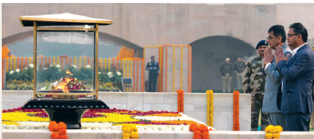
On 30 January 2024, the Chief Justice of India, Dr D Y Chandrachud paid tributes to Mahatma Gandhi on his 76th death anniversary at Rajghat