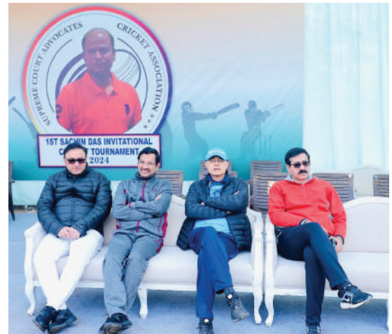
Justice M M Sundresh at the 1st Sachin Das Invitational Cricket Tournament inauguration conducted by the Supreme Court Advocates Cricket Association at Modern School, New Delhi on 13 January 2024