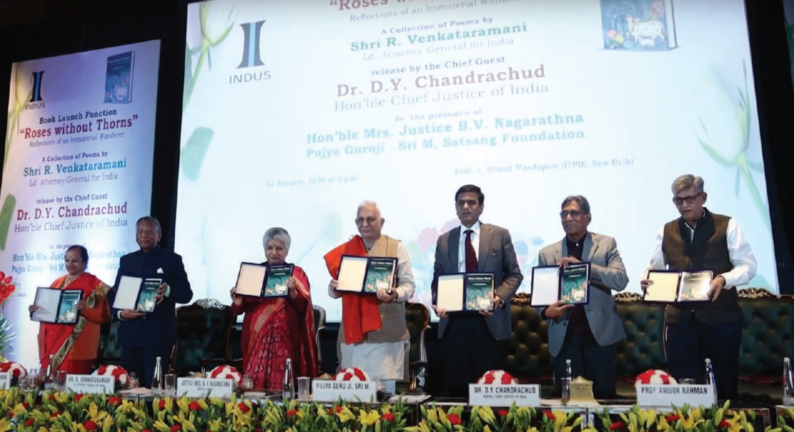
On 12 January 2024, the Chief Justice of India, Dr D Y Chandrachud released the book 'Roses without Thorns' penned by Attorney General for India, R Venkataramani in presence of Justice B V Nagarathna at Audi-1, Bharat Mandapam (TIPO), New Delhi