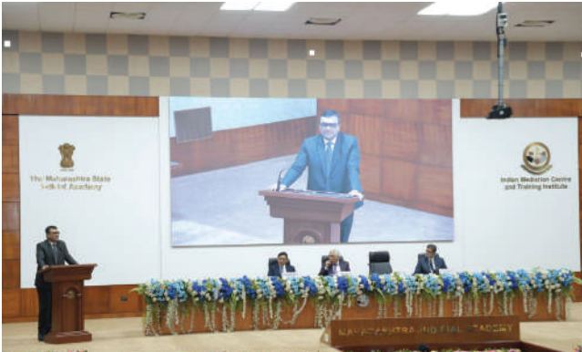
Justice Dipankar Datta addressing the audience at the inaugural session of the West Zone-I Regional Conference on “Contemporary Judicial Developments and Strengthening Justice through Law and Technology” at Uttan, Maharashtra on 13 January 2024