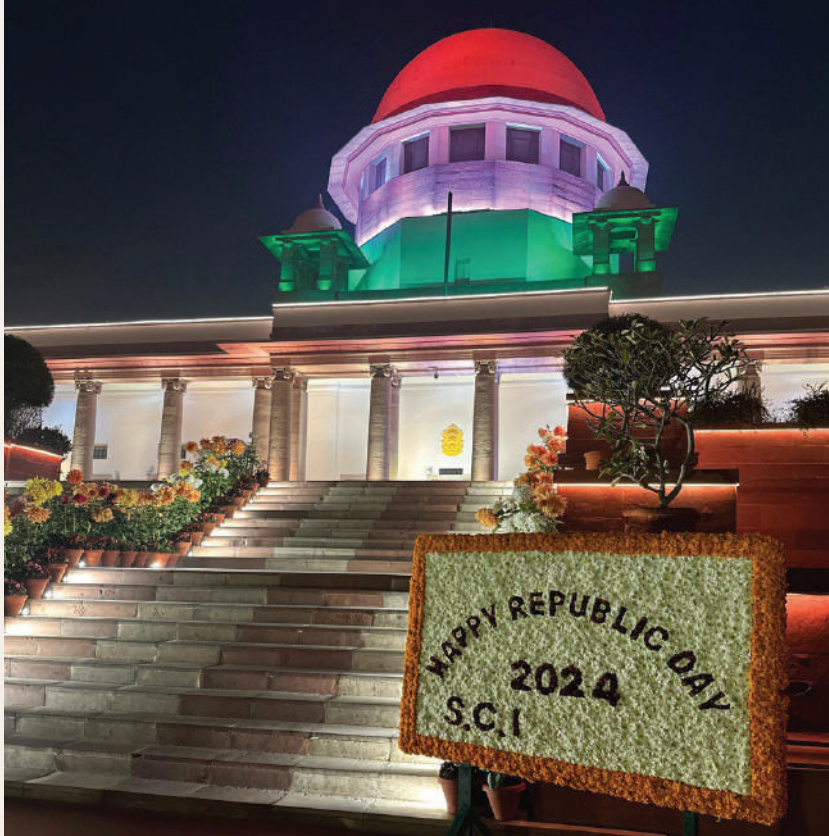
On 26 January 2024, the Supreme Court of India lit up in tricolour on the occasion of Republic Day