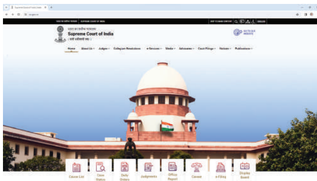
New Supreme Court Website

The new website of the Supreme Court was launched for an enhanced user experience, characterised by a dynamic and functional design, a user friendly interface, and robust content management. It provides users with convenient access to comprehensive information about the organisation, pivotal technology based services, crucial documents, and important updates. The website has been meticulously crafted within the ‘Secure, Scalable and Suganya Website as a Service’ (S3WAAS) framework of National Information Centre (NIC), prioritising accessibility for differently-abled users.