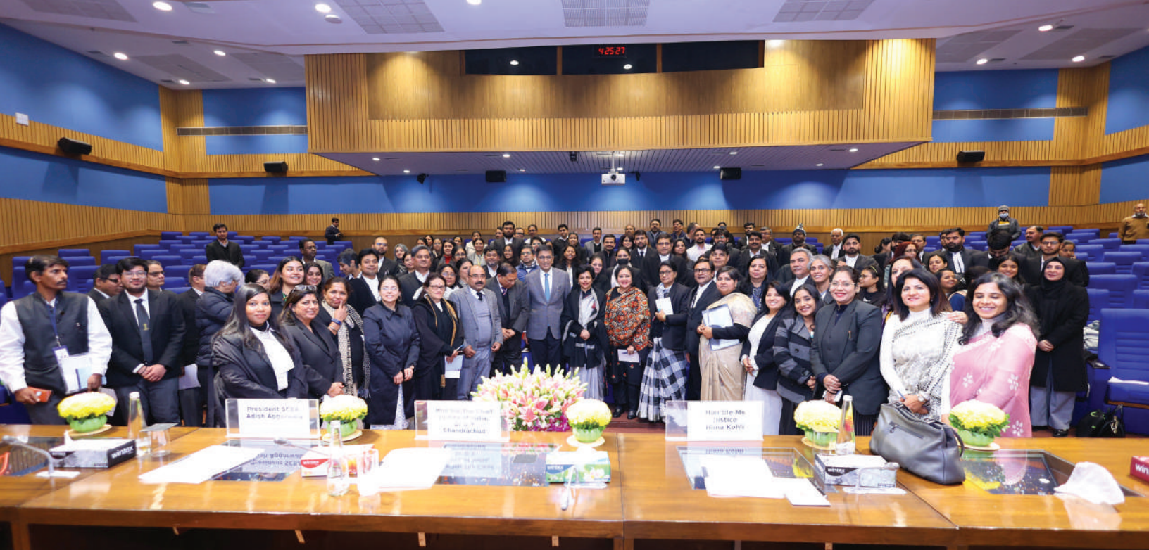
Group Photo taken during the 'Gender Sensitisation and Prevention of Sexual Harassment at Workplace' training held on 19 January 2024