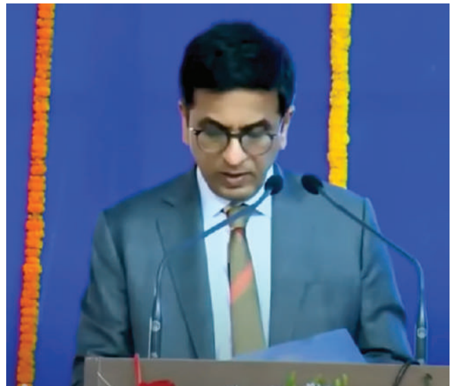
The Chief Justice of India, Dr D Y Chandrachud inaugurating the District Court Complex (Nyaya Mandir) at Rajkot, Gujarat

Such initiatives not only underscore the judiciary's proactive approach to embracing innovation but also reflect the Chief Justice of India, Dr D Y Chandrachud's commitment to enhancing accessibility and efficiency in the delivery of justice.