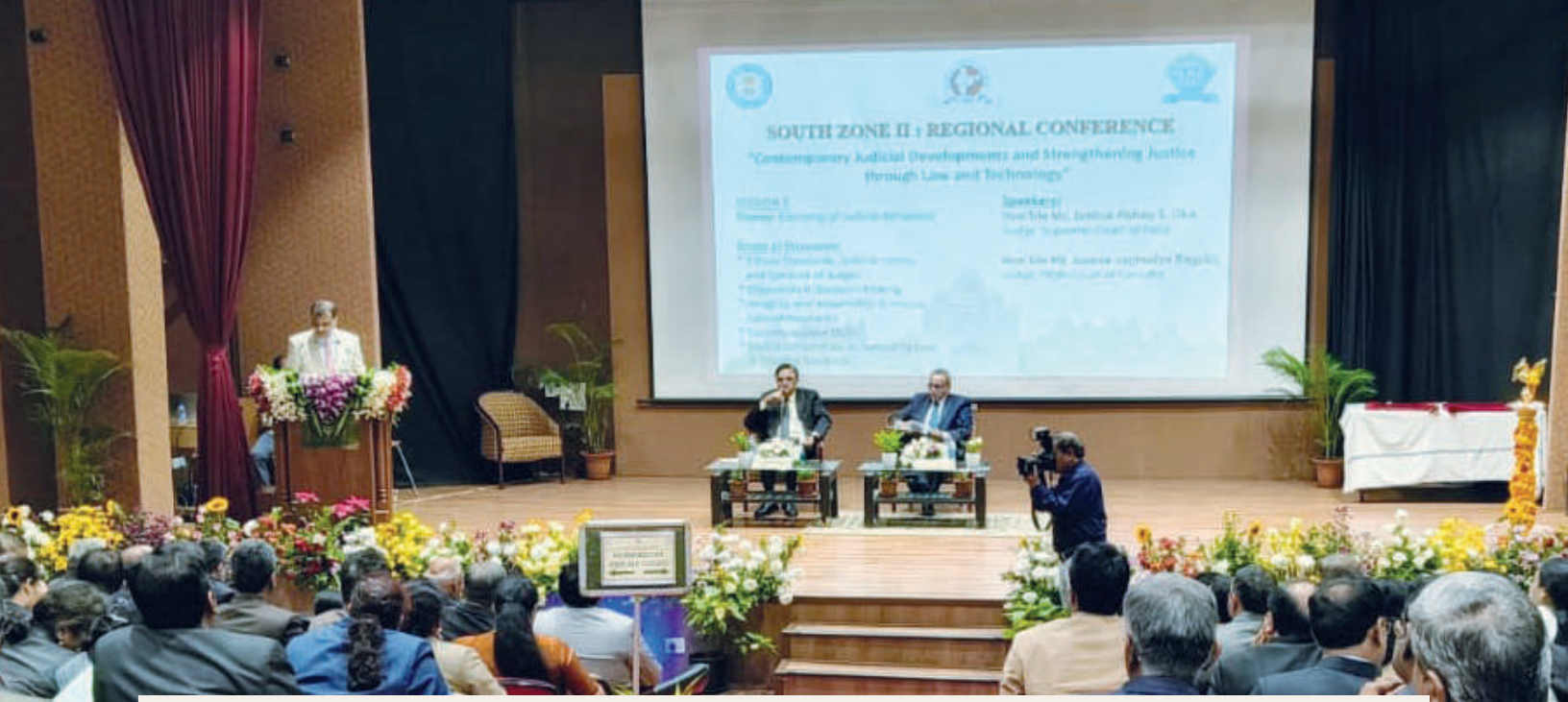
Justice Abhay S Oka presiding over Session-2 on the theme 'Elements of Judicial Behaviour' conducted at South Zone-II: Regional Conference on Contemporary Judicial Developments and Strengthening Justice through Law and Technology at Dr M C R, H R D Institute, Jubilee Hills, Hyderabad

The South Zone-II: Regional Conference on “Contemporary Judicial Developments and Strengthening Justice through Law and Technology” was organised by National Judicial Academy (NJA) in collaboration with the High Court for the State of Telangana and the Telangana State Judicial Academy at Dr MCR HRD Institute, Jubilee Hills, Hyderabad. On 6 January 2024, Justice Abhay S Oka presided over Session-2 on the theme ‘Elements of Judicial Behaviour’ and the Session-3 titled ‘Judgment Writing Tools’ was presided over by Justice Ujjal Bhuyan. On 7 January 2024, Justice Rajesh Bindal presided over Session-4 on the theme “Overview of e-Courts Projects” as a resource person.