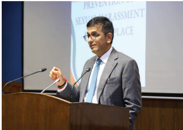
The Chief Justice of India, Dr D Y Chandrachud addressing the participants at GSICC training on 19 January 2024