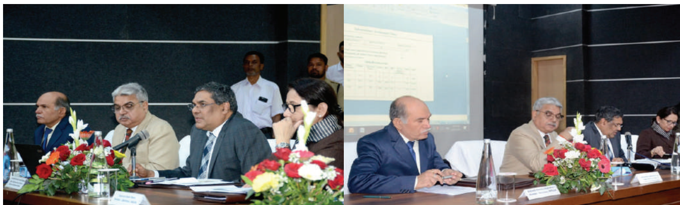
Executive Chairman, NALSA, Justice Sanjiv Khanna chaired the first-ever State Level Conference of District Legal Services Authorities of Madhya Pradesh on 13 January 2024 at Bhopal, Madhya Pradesh

NALSA organised two important programmes in January 2024 namely the State Level Conference of District Legal Services Authorities of Madhya Pradesh on 13 January 2024 at Bhopal and the Launch of Pan-India Campaign, "Restoring the Youth: Pan-India Campaign for Identifying Juveniles in Prisons and Rendering Legal Assistance – 2024" on 25 January 2024.