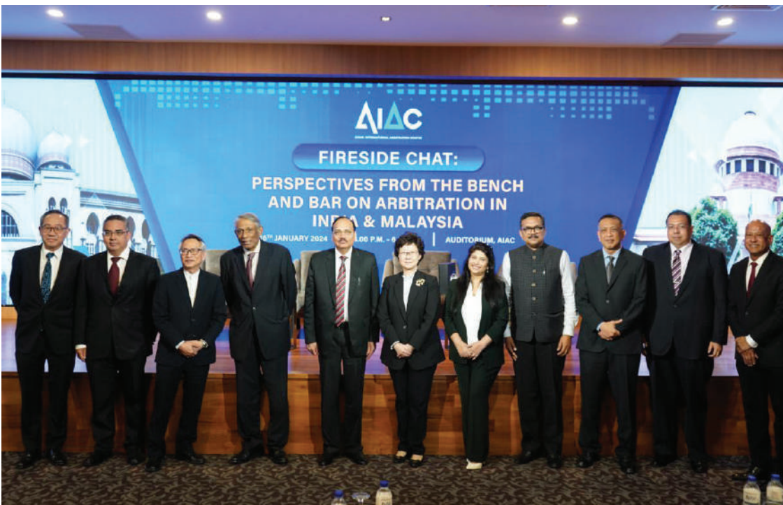
Justice Surya Kant presided as the Chief Guest at the Asian International Arbitration Centre's (AIAC) seminar on 'Perspectives from the Bench and Bar on Arbitration in India and Malaysia' on 16 January 2024