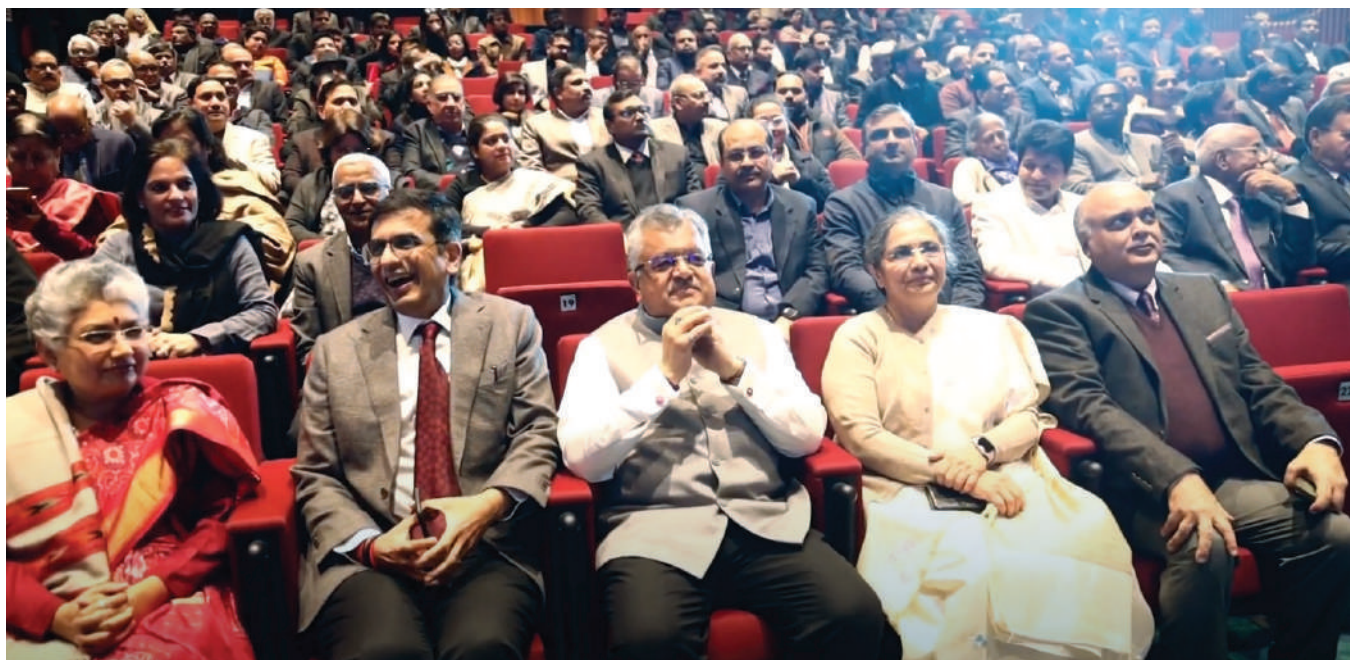
From left to right: Justice B V Nagarathna, the Chief Justice of India, Dr D Y Chandrachud, Solicitor General, Tushar Mehta, Justice Bela Trivedi and Justice Ahsanuddin Amanullah at the book launch 'Roses without Thorns' on 12 January 2024