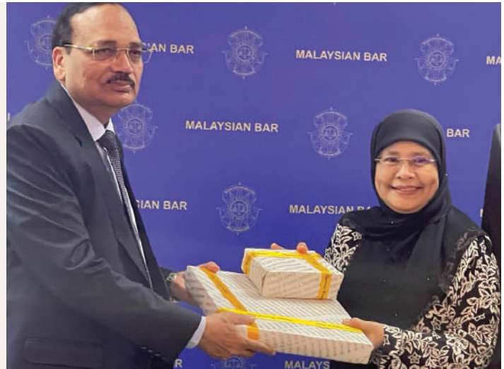
Justice Surya Kant with Justice Tun Tengku Maimun binti Tuan Mat (Chief Justice, Federal Court Malaysia) at the launch of Malaysian International Mediation Centre on 15 January 2024, Kuala Lumpur