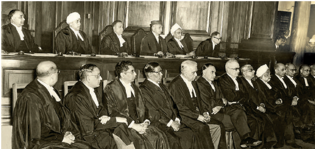
First sitting of the six Judges of the Supreme Court along with 13 Chief Justices from various High Courts on 28 January 1950

Today, the Supreme Court operates with a more streamlined approach, typically convening with a Bench of two Judges, unless the complexity of the case warrants a larger panel. Recent years have seen a concerted effort to tackle the backlog of cases, with a proactive measure towards reducing pendency. In 2023 alone, a remarkable 52,221 cases were disposed of and much credit is owed to technology, which has been instrumental in expediting processes, particularly through e-filing systems that minimise delays.