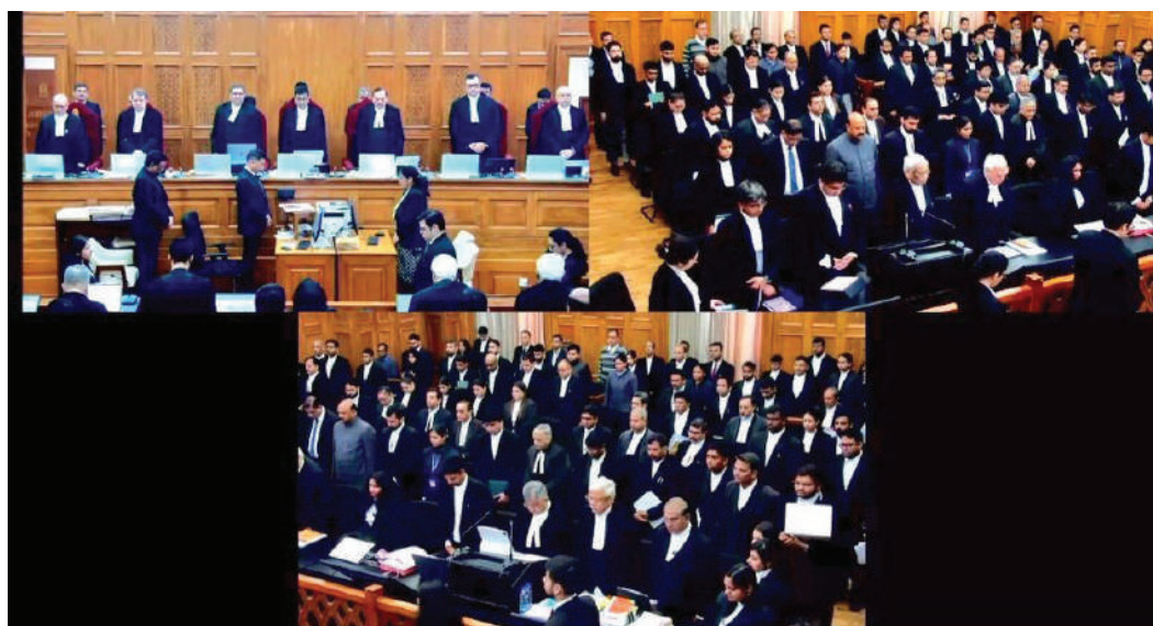
On 30 January 2024, the Supreme Court observed Martyrs' Day