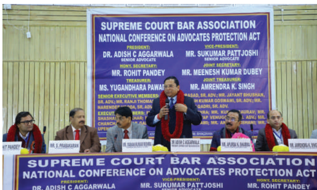
On 27 January 2024, Supreme Court Bar Association organised a National Conference on Advocates Protection Act, at VK Krishna Menon Bhawan, Indian Society of International Law, New Delhi