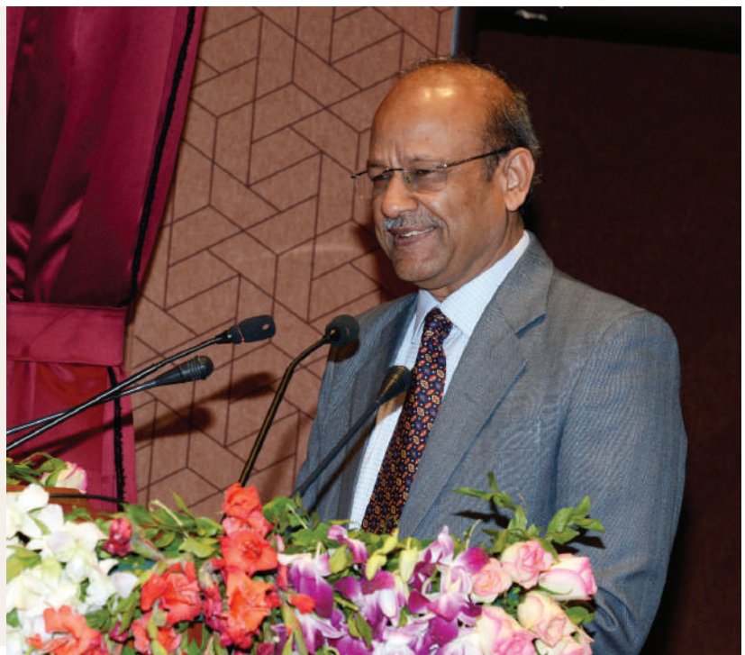
Justice Rajesh Bindal presiding over Session-4 on the theme “Overview of e-Courts Projects” conducted at South Zone-II: Regional Conference on Contemporary Judicial Developments and Strengthening Justice through Law and Technology at Dr M C R, H R D Institute, Jubilee Hills, Hyderabad

The South Zone-II: Regional Conference on “Contemporary Judicial Developments and Strengthening Justice through Law and Technology” was organised by National Judicial Academy (NJA) in collaboration with the High Court for the State of Telangana and the Telangana State Judicial Academy at Dr MCR HRD Institute, Jubilee Hills, Hyderabad. On 6 January 2024, Justice Abhay S Oka presided over Session-2 on the theme ‘Elements of Judicial Behaviour’ and the Session-3 titled ‘Judgment Writing Tools’ was presided over by Justice Ujjal Bhuyan. On 7 January 2024, Justice Rajesh Bindal presided over Session-4 on the theme “Overview of e-Courts Projects” as a resource person.