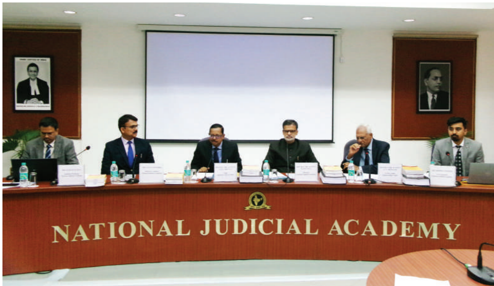
On 20 January 2024 Justice Ujjal Bhuyan presided over Session 1 – Fair Trial and Session 2 – The Triple Method of Plea Bargain, Compounding and Probation at the National Conference on ‘Sentencing, Probation and Victim Compensation,’ held by the National Judicial Academy, Bhopal