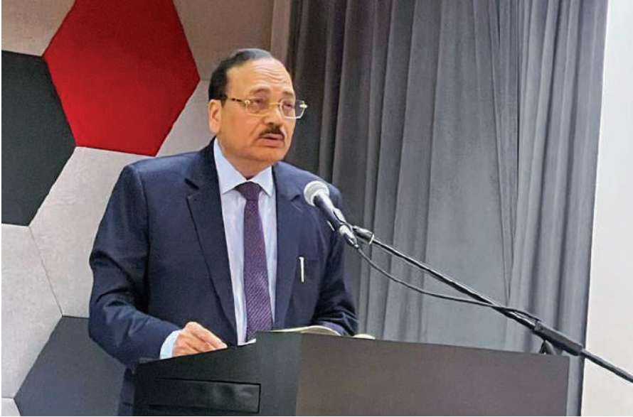
On 15 January 2024, Justice Surya Kant presided as the keynote speaker at the launch of the Malaysian International Mediation Centre at Kuala Lumpur