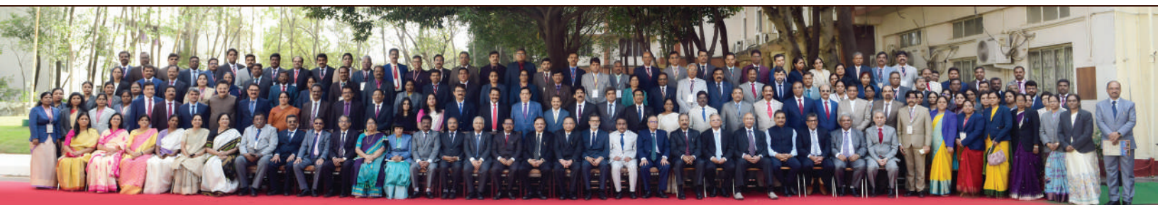
On 6 January 2024, Justice Ujjal Bhuyan and Justice Abhay S Oka presided over the sessions conducted at South Zone-II: Regional Conference on Contemporary Judicial Developments and Strengthening Justice through Law and Technology at Dr M C R, H R D Institute, Jubilee Hills, Hyderabad