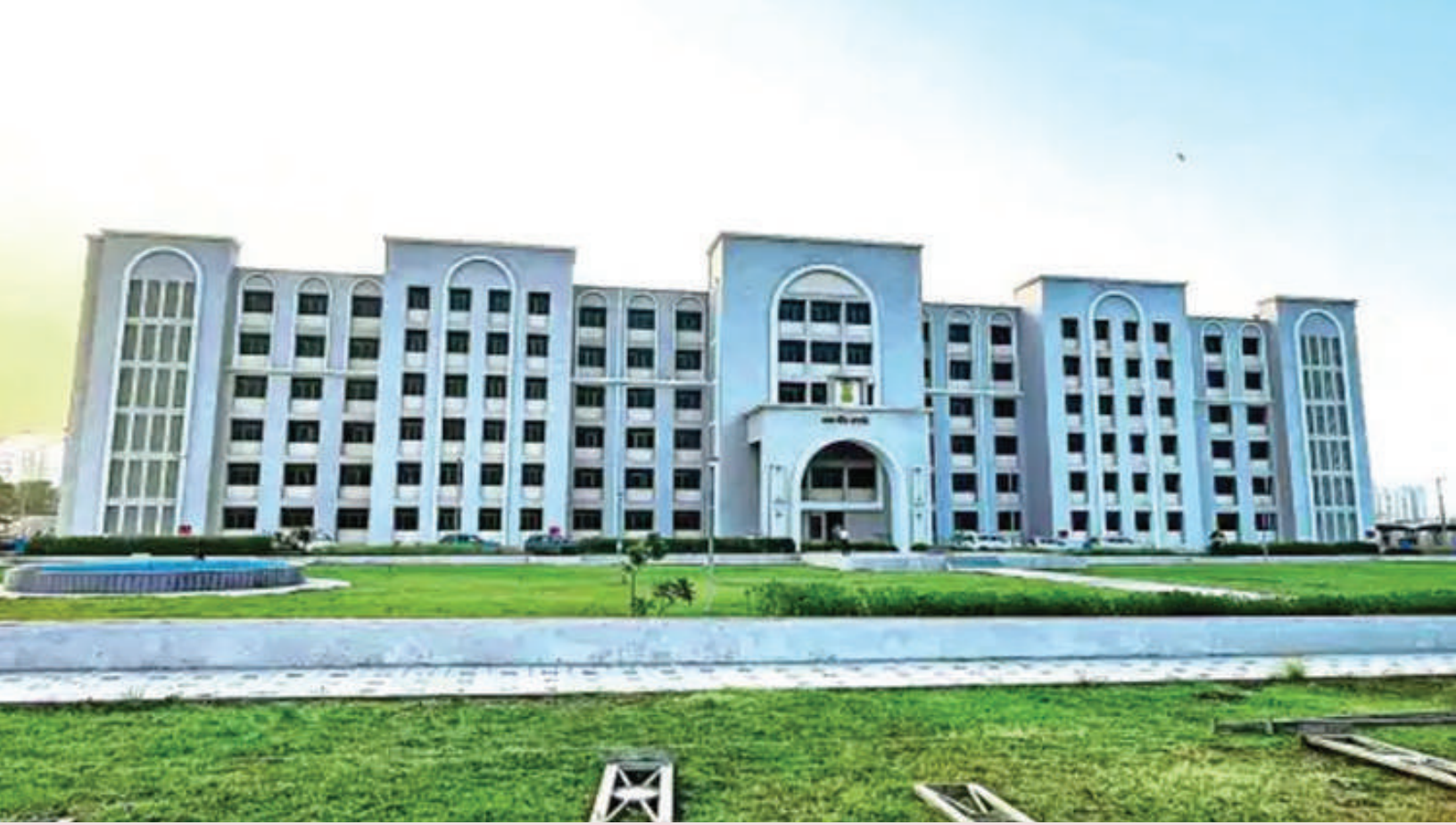
New District Court Complex (Nyaya Mandir) at Rajkot, Gujarat

This exemplary establishment, equipped with amenities such as crèches and accessible toilets, alongside cutting-edge technology integration, marks a pivotal milestone in ensuring equitable access to justice. The launch of e-filing 3.0 for Gujarat's district judiciary, coupled with the introduction of a video conferencing witness deposition centre and an AI-based text-to-speech callout system by the Gujarat High Court, represents a groundbreaking advancement in legal proceedings.