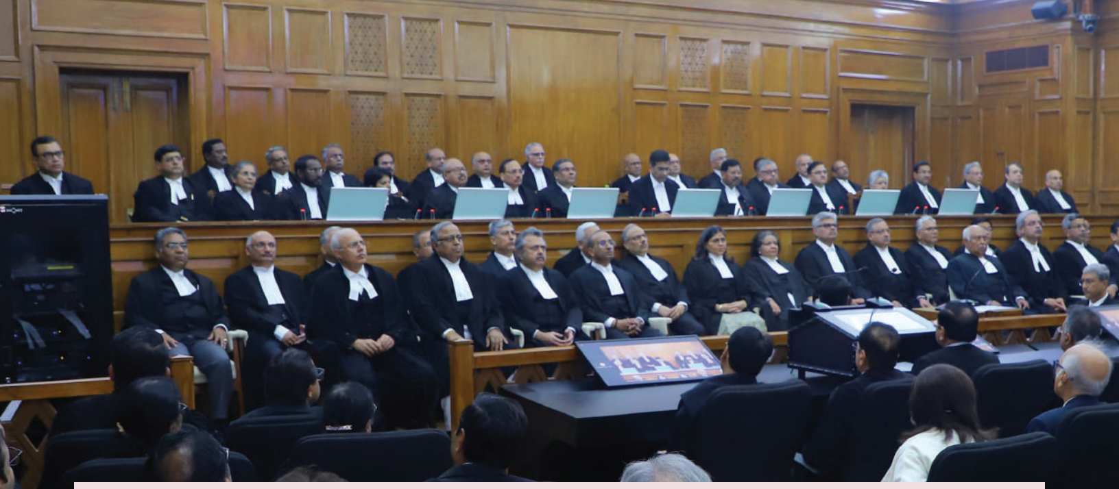
On 28 January 2024, the Chief Justice of India, Dr D Y Chandrachud chaired a Ceremonial Bench with Supreme Court Judges and the Chief Justices of 25 High Courts across the country to commemorate the first sitting of the Supreme Court