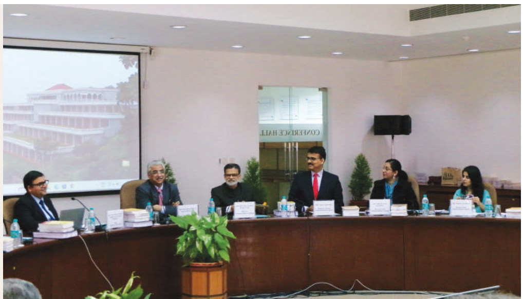
Justice Aravind Kumar presided over Session 4 – Court and Case Management and Session 5 – Interim Orders and Judicial Discretion during an orientation course for newly elevated high court judges on 21 January 2024 at National Judicial Academy, Bhopal