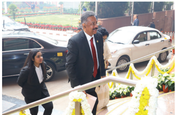
Justice Jayantha C Jayasuriya (Chief Justice of Sri Lanka) heading towards the auditorium on the occasion of Diamond Jubilee Celebrations