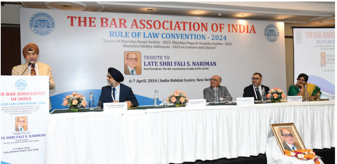
6 April 2024, Justice Ahsanuddin Amanullah, Chief Guest, delivers an address during the Rule of Law Convention, 2024 organised by the Bar Association of India at India Habitat Centre, New Delhi