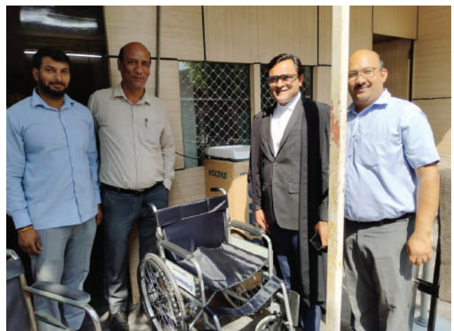
23 April 2024, the SCBA places wheelchairs at all entry gates of the Supreme Court