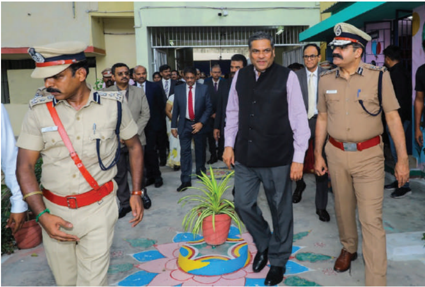
28 April 2024, Justice Sanjiv Khanna at the Madurai Central Prison, interacts with the prison inmates, jail officials, doctors and counsellors posted at the Prison Hospital, Tamil Nadu