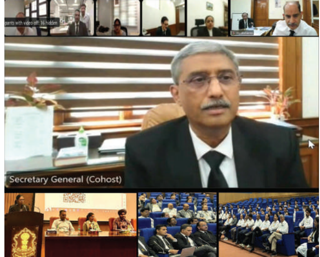
23-25 April 2024, Secretary General, Atul M Kurhekar delivers an inaugural address at the e-HRMS 2.0 Training for 951 officials of Registry including 714 physical and 237 online participants at the Multipurpose Hall, Supreme Court of India