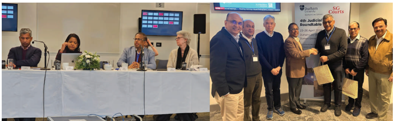
23-26 April 2024, the Chief Justice of India, Dr D Y Chandrachud (virtually), Justice K V Viswanathan and Justice Sundaresh Menon (Chief Justice of Singapore) at the 4th Judicial Roundtable on Commercial Law organised by the Supreme Court of Singapore, held at Durham Law School, London