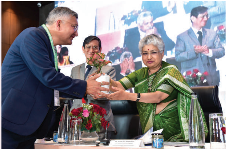
7 April 2024, Justice B V Nagarathna, Member of the Family Courts Committee, Supreme Court of India delivers a special address in the valedictory session at the Northern Zone Regional Conference, Dehradun