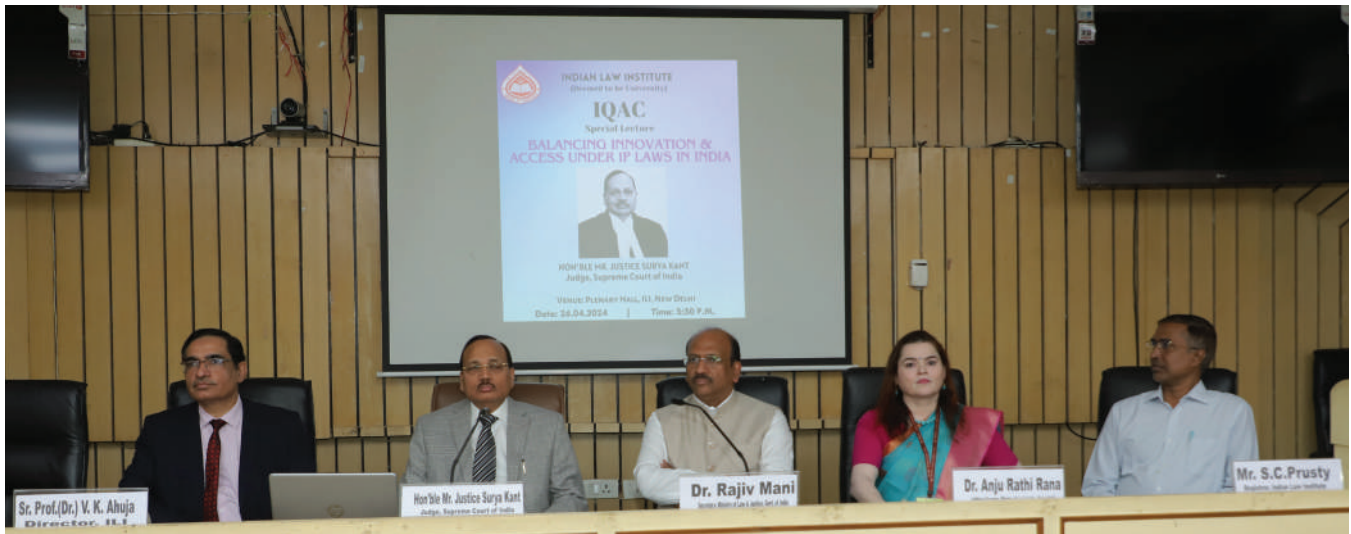
26 April 2024, Justice Surya Kant, Chief Guest, attend the Indian Law Institute website launch, on the occasion of IPR Day