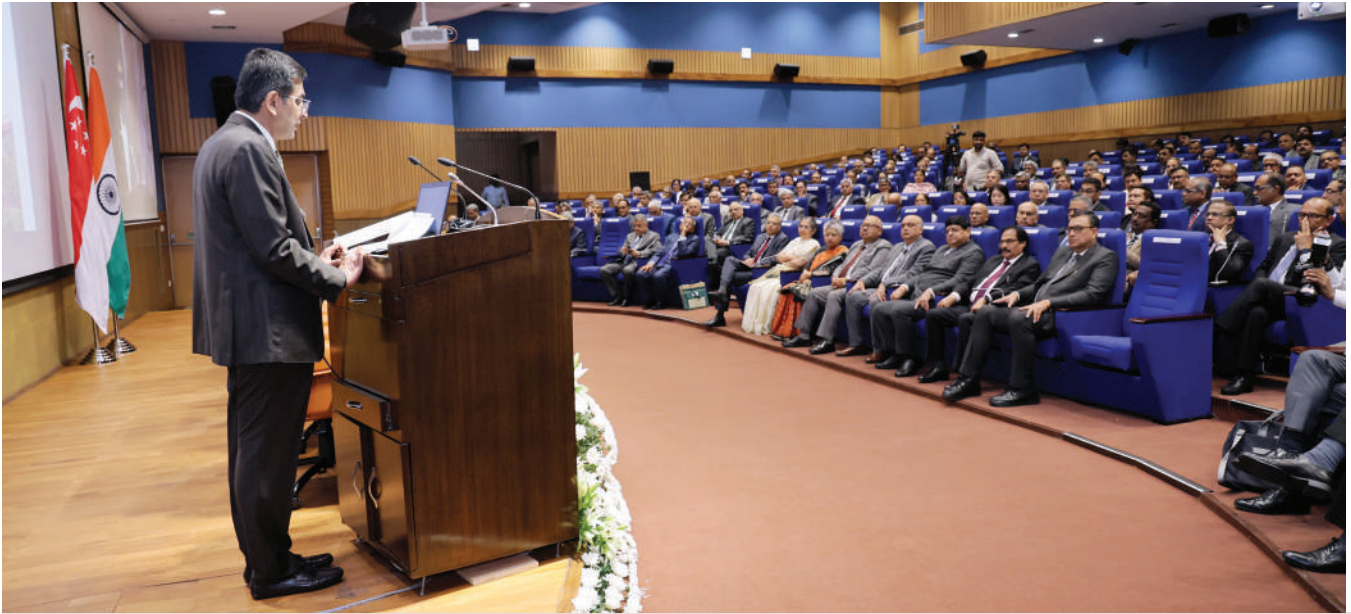
13 April 2024, the Chief Justice of India, Dr D Y Chandrachud delivers an address at the Conference on Technology and Dialogue between the Supreme Courts of India and Singapore, held at Multipurpose Hall, Supreme Court of India