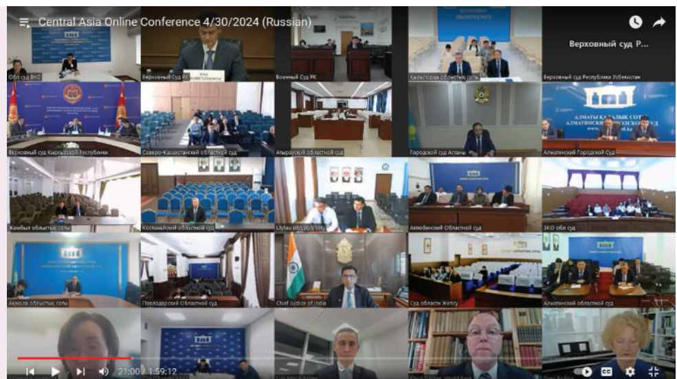
30 April 2024, the Chief Justice of India, Dr D Y Chandrachud delivers an address at the Central Asia Online Conference on 'Information and Technology in Courts' organised by the Republic of Kazakhstan