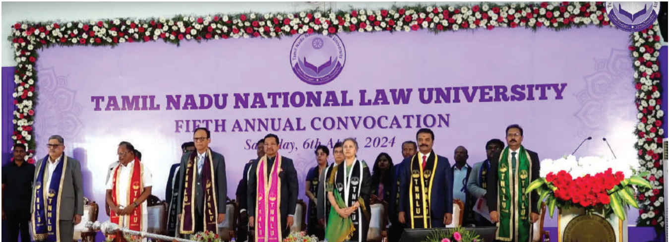
6 April 2024, Justice M M Sundresh attends the fifth Annual Convocation of the Tamil Nadu National Law University, Tiruchirapalli