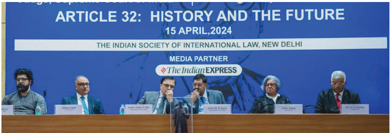
15 April 2024, Justice B R Gavai and Justice Abhay S Oka co-chair the Ambedkar Memorial Lecture series on “Article 32 : History and the Future” at ISIL organised by the Society for Constitution and Social Democracy and The Leaflet