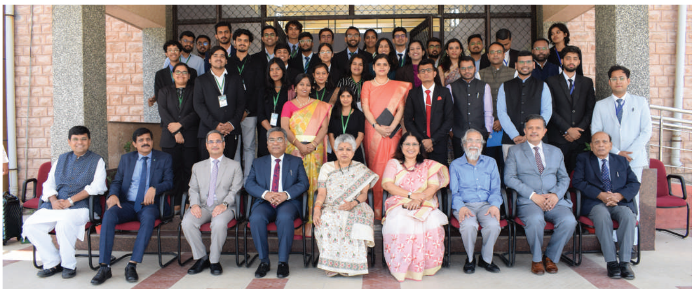
21 April 2024, Justice B V.Nagarathna delivers a lecture on the theme "Celebrating 75th Years of Indian Supreme Court" at the National Conference organised by the National Law University, Jodhpur