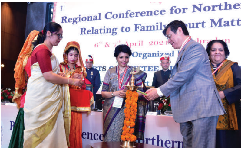
6 April 2024, Justice Hima Kohli, Chairperson of the Family Courts Committee, Supreme Court of India at the Northern Zone Regional Conference, Dehradun