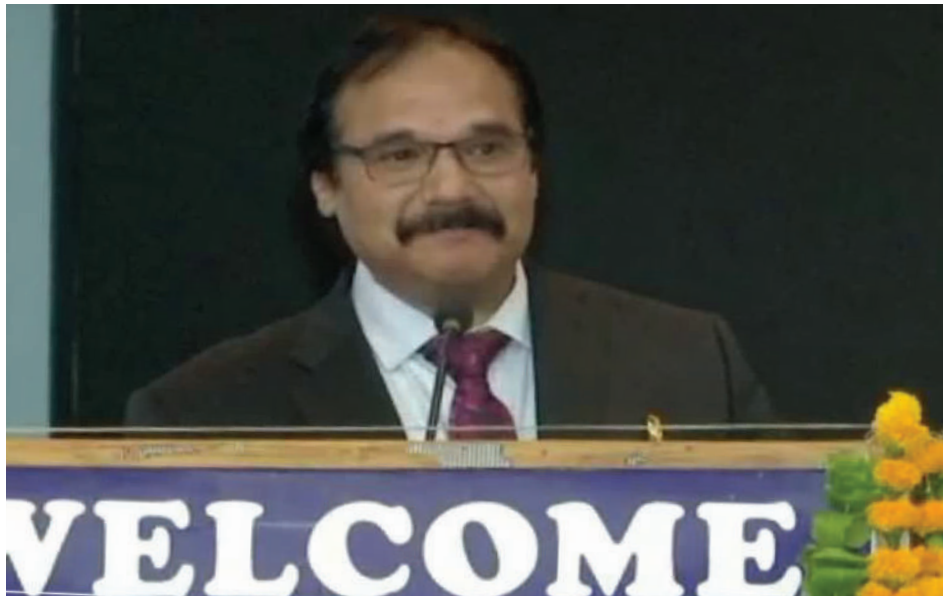
27 April 2024, Justice Prashant Kumar Mishra, at the 75th year anniversary of the establishment of Rajasthan High Court at Jaipur organised by Rajasthan High Court Bar Association