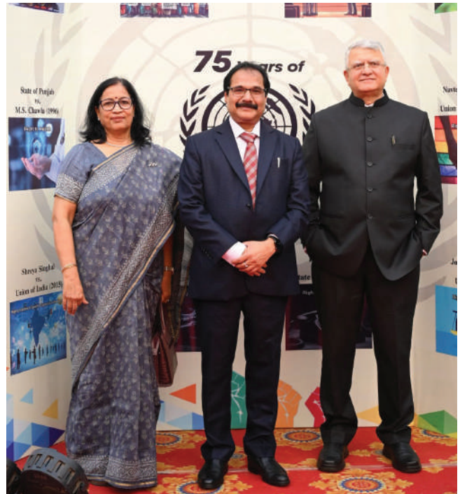
6 April 2024, Justice Prashant Kumar Mishra attends the Golden Jubilee International Conference organised by University Law College, Utkal University, Bhubaneswar