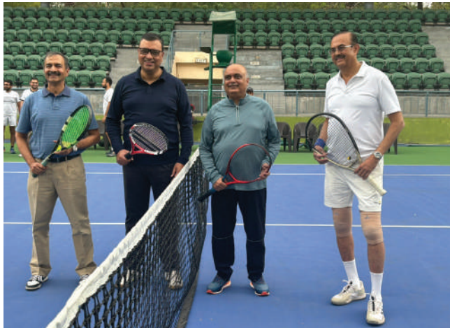
5 April 2024, Justice Ahsanuddin Amanullah and Justice Dipankar Datta at the inauguration ceremony of the Annual Lawn Tennis Tournament at DLI Stadium organised by the Executive Committee, Supreme Court Bar Association (SCBA)