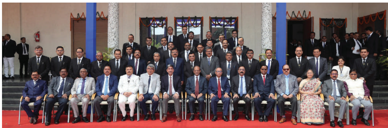
20 April 2024, Justice Rajesh Bindal, Chief Guest, attends the State Level Conference on Case Management: Inculcating Public Trust and Confidence organised by the Judicial Academy, Ranchi, Jharkhand