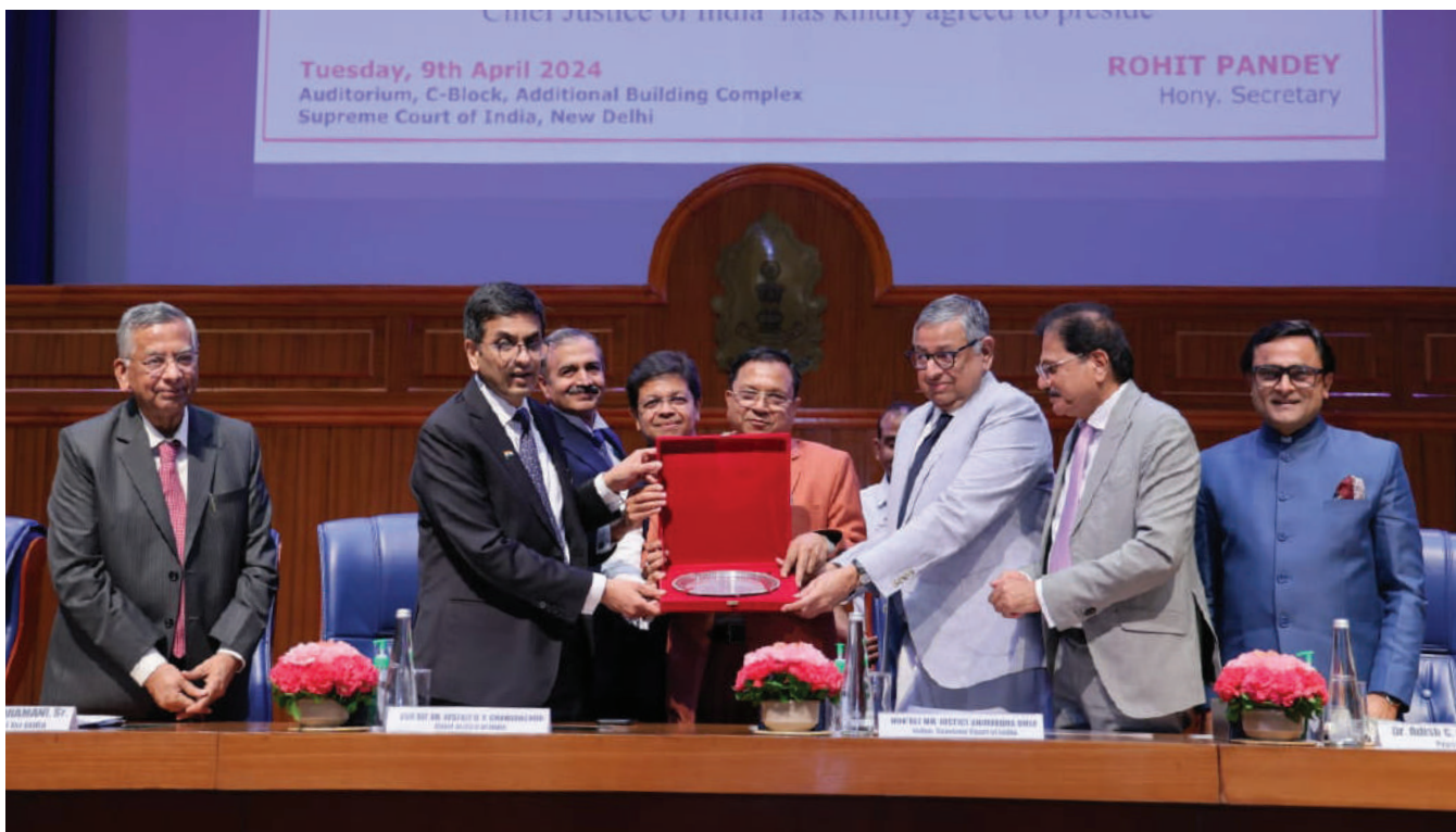
9 April 2024, the Chief Justice of India, Dr D Y Chandrachud along with Attorney General of India and SCBA members bestow a ceremonious memento upon Justice Aniruddha Bose during a heartfelt farewell