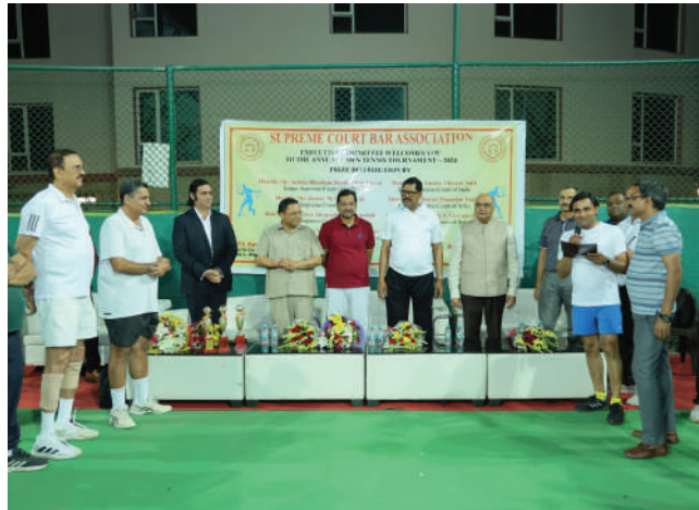
7 April 2024, Justice B R Gavai, Justice M M Sundresh, and Justice Ahsanuddin Amanullah distribute prizes to the winners and runners-up of the Annual Lawn Tennis Tournament 2024, organised by SCBA