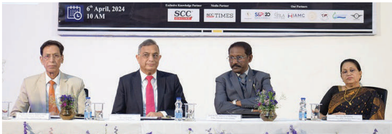
6 April 2024, Justice C T Ravikumar attends the final round and the valedictory ceremony as the Chief Guest at the National Moot Court Competition, 2024, School of Law, Delhi Metropolitan Education, Noida