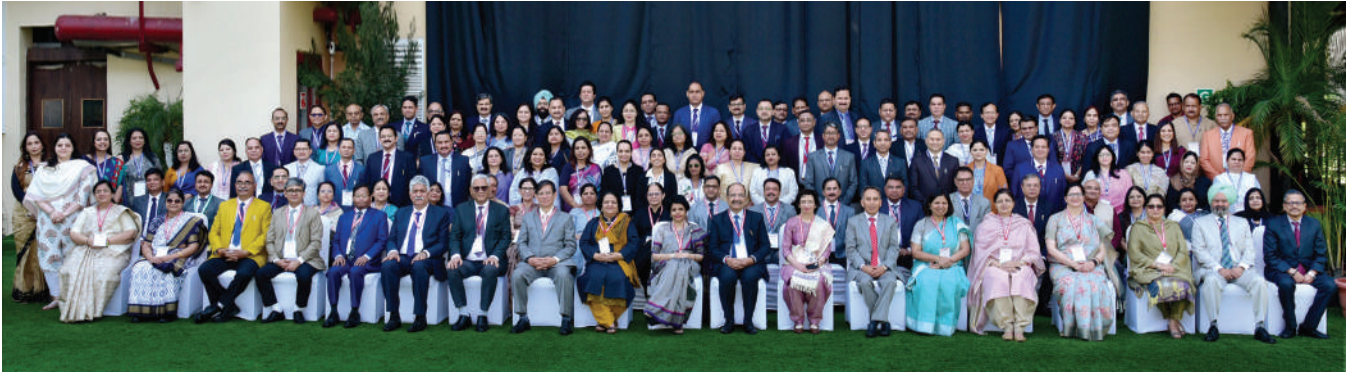
6 April 2024, the Northern Zone Regional Conference of the Family Courts Committee at Dehradun