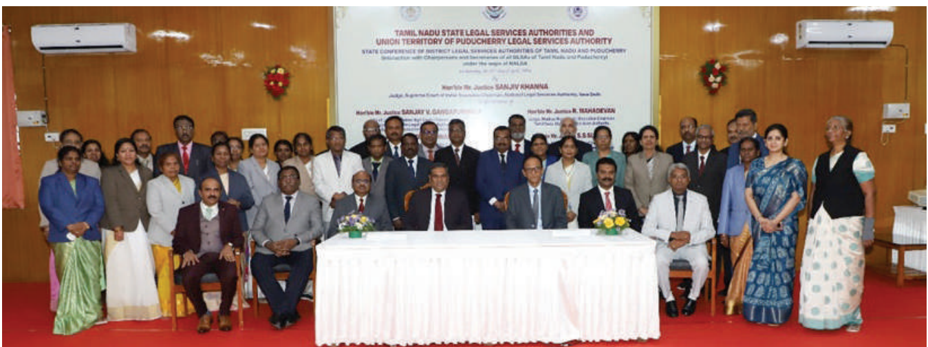
27 April 2024, Justice Sanjiv Khanna delivers an address during the Conference of DLSAs of Tamil Nadu and Puducherry at ADR Building, Madras High Court