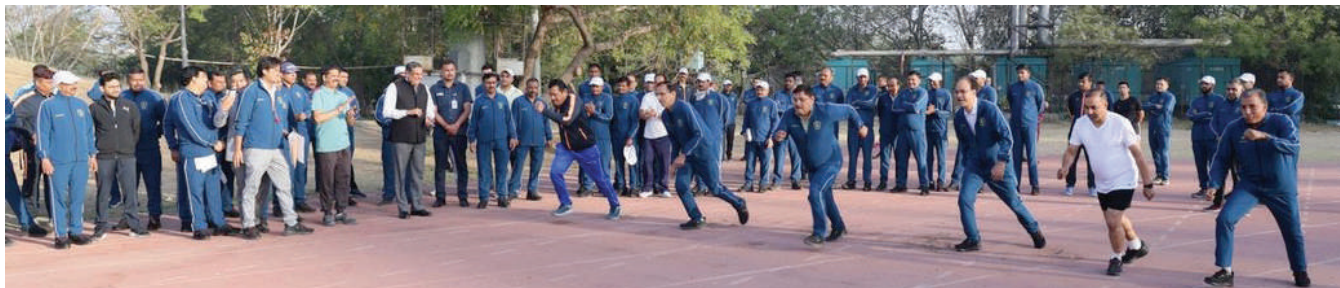
4 April 2024, Justice Sanjiv Khanna attends the mini-marathon held at Jawaharlal Nehru Stadium, New Delhi