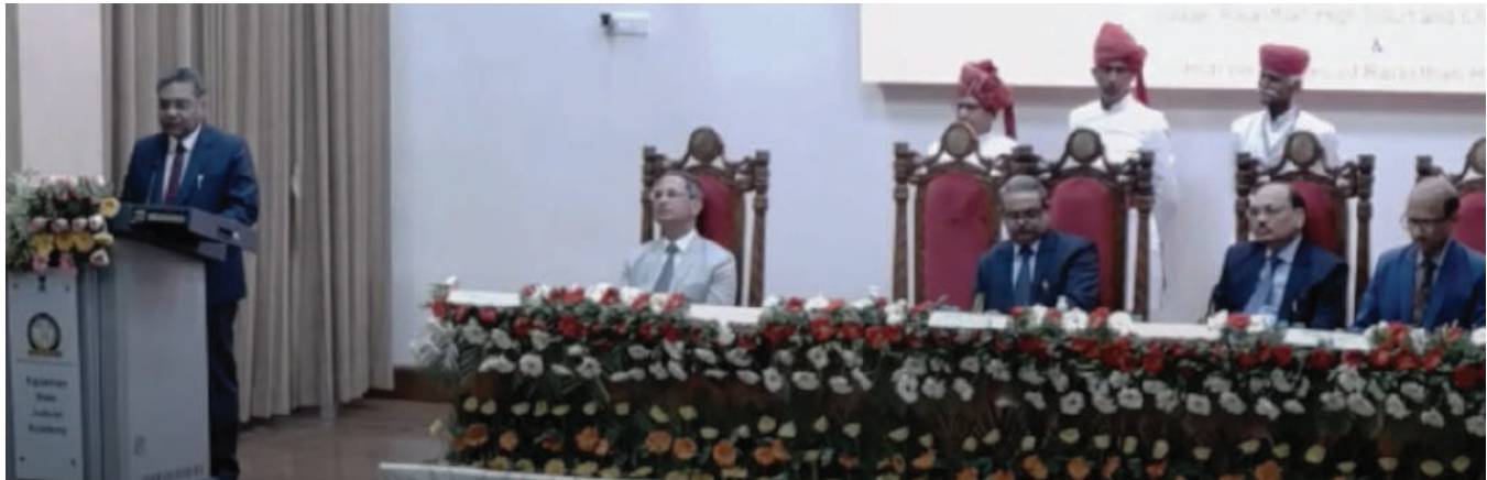
6 April 2024, Justice Surya Kant, Justice Augustine George Masih and Justice Sandeep Mehta at the valedictory session of One Year Induction & Training Programme of Judicial Officers at Rajasthan State Judicial Academy, Jodhpur