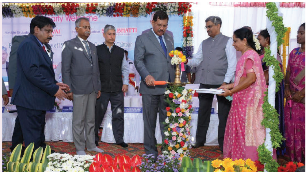
27 April 2024, Justice B R Gavai and Justice S V N Bhatti attend the inauguration of 15 Courts Building Complex, organised by the Principal District Judge and President and Members of Bar Association, Chittoor