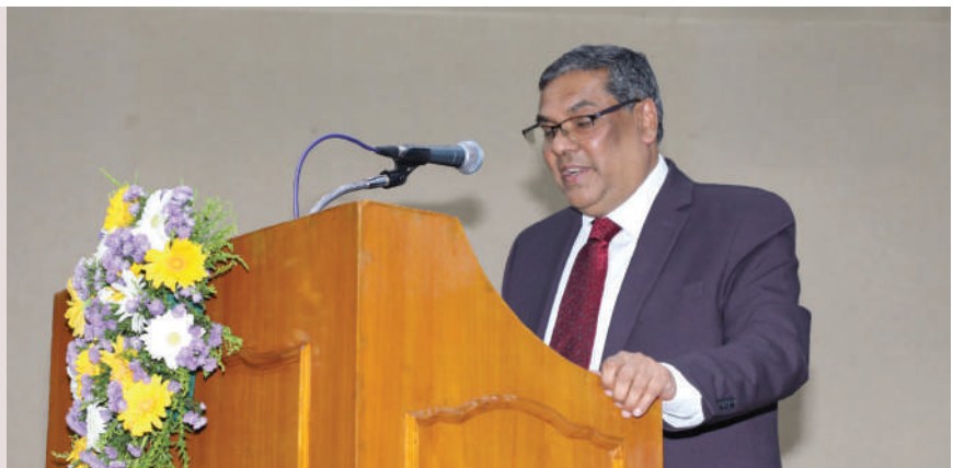
27 April 2024, Justice Sanjiv Khanna delivers an inaugural address during the Special Training on Mediation Act, 2023, at the Auditorium of the Madras High Court