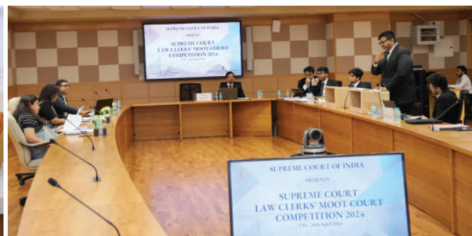
28 April 2024, the semi-final rounds taking place in the Supreme Court premises