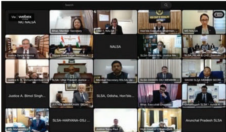
8 April 2024, Justice Sanjiv Khanna, Executive Chairman, NALSA release a framework and schedule for quarterly meetings of the Under Trial Review Committees