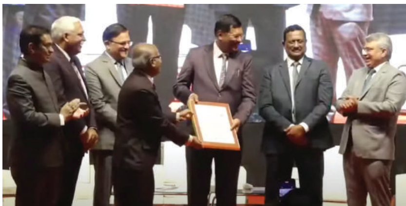
6 April 2024, Justice B R Gavai, Justice Abhay S Oka, and Justice P B Varale attend the felicitation program of the designated Senior Advocates and Advocates (HCBA Members) with 50 years of practice held at Vasant Rao Deshpande Hall, Civil Lines, Nagpur