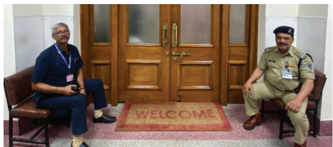
Security personnel deployed outside judges gallery at the Supreme Court of India

Pursuant to directions of the Chief Justice of India, we have recently introduced state-of-the-art security equipment including under-vehicle scanners, Radio Frequency IDentification (RFID) tag system for vehicles, boom barriers and bollards at the gates. Automatic crash resistant sliding gates are also being introduced at the gates. The Su-Swagatam system is also being integrated with the access control system to ensure faster entry of stakeholders. In fact, we have also implemented a process for online intimation regarding various conferences, meetings so that entry of vehicles and stakeholders is facilitated.