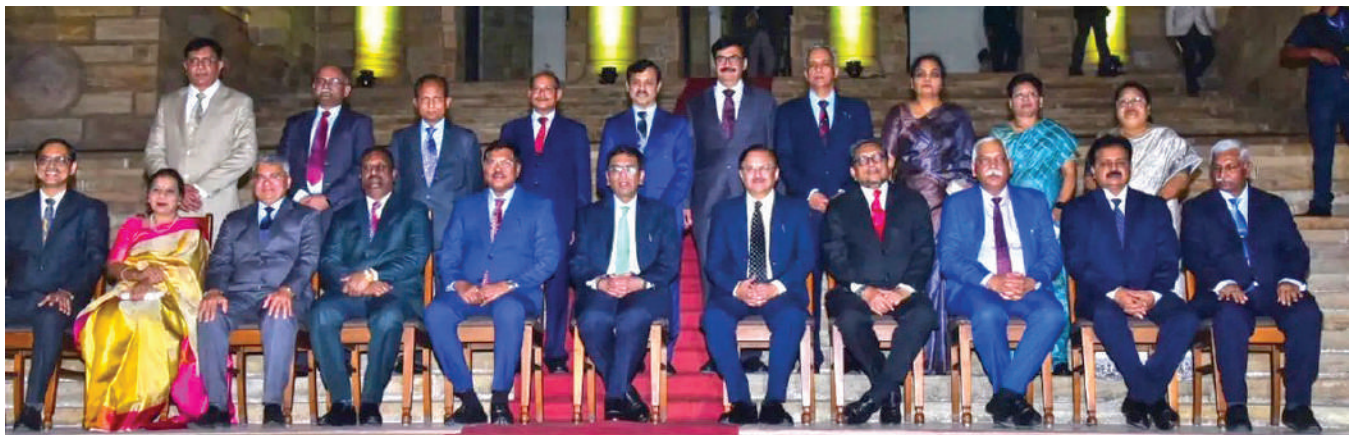
5 April 2024, the Chief Justice of India, Dr D Y Chandrachud, Justice B R Gavai, Justice Abhay S Oka, and Justice P B Varale attend the inaugural centenary year celebration program of the High Court Bar Association, Nagpur