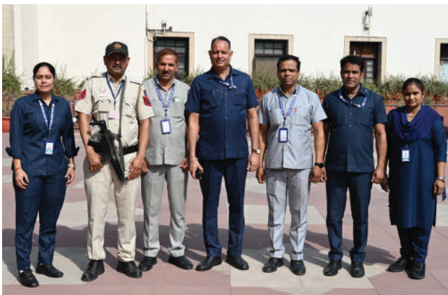
Security personnel deployed outside courtroom corridors ensuring security within the premises