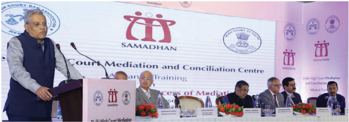
5-6 April 2024, Justice P.S.Narasimha delivers a special address at the inaugural session of Samadhan in the presence of Justice Sanjiv Khanna and Justice Sanjay Karol at Delhi High Court Mediation and Conciliation Centre, advance training on “The Concept and Process of Mediation” at Agra, UP