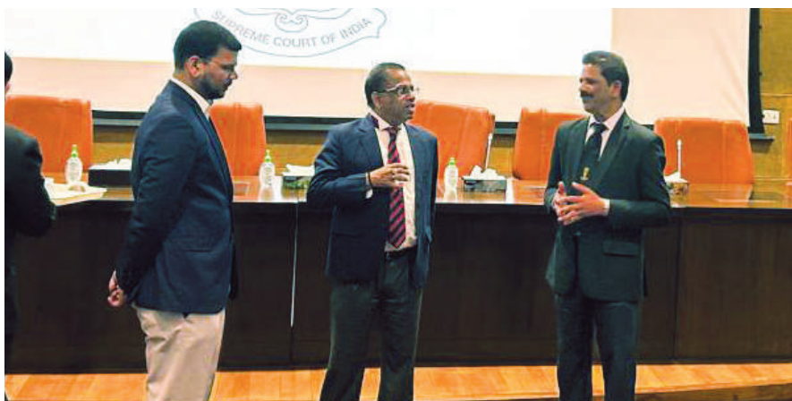
10 April 2024, Justice K V Viswanathan attends the quiz competition held at the multipurpose hall, B block, Additional Building Complex, Supreme Court of India