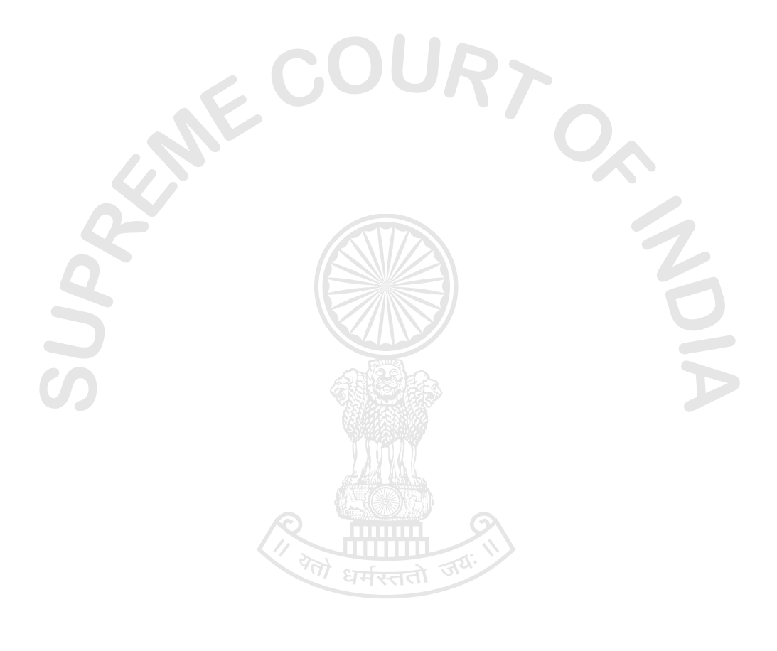
May 02, 2016